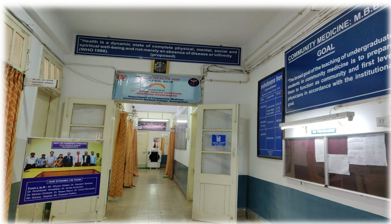
DEPARTMENT OF COMMUNITY MEDICINE