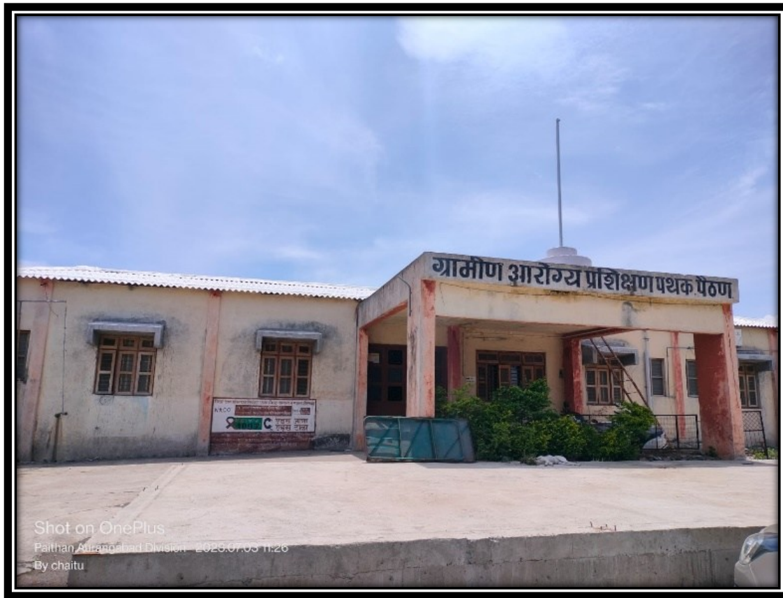
RURAL HEALTH TRAINING CENTRE, PAITHAN