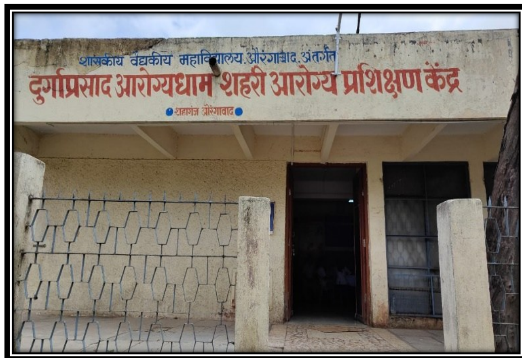
URBAN HEALTH TRAINING CENTRE, SHAHGUNJ